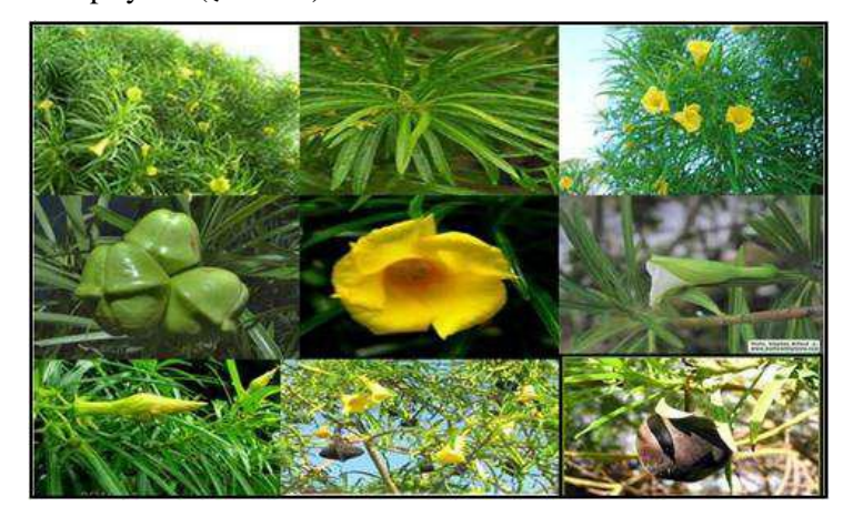
Fig. 2: Parts of Thevetia peruviana having fruits, flowers, mature fruits, buds and branches having fruits and flowers

(Encyclopaedia of World of Medicinal Plants). The medicinal value of this plant ranges from the being an extreme cardiotonic agent<sup>9</sup>.